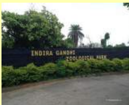
INDIRA GANDHI ZOO PARK