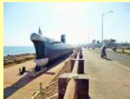
INS KURUSURA SUBMARINE