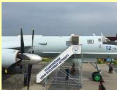
TU 142 AIR CRAFT MUSEUM